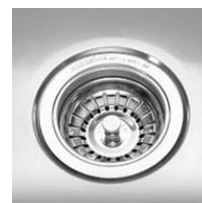
AC09 Basket Waste x 1